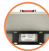
Rugged aluminum enclosure