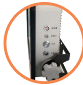
DGNS / RTK Input