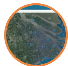
Turnkey Web Management