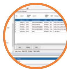
Full-GNSS Positioning Services